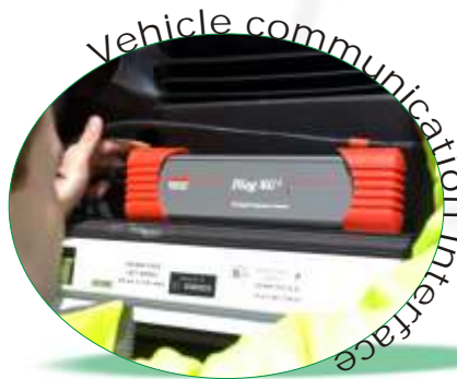
Vehicule communication interface

The vehicle communication interface is equipped with Wireless-Lan and offers a secure use also on the road !